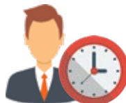
Elaun Bekerja Semula Awal (EBSA)