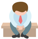
Elaun Mencari Pekerjaan (EMP)