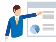
Training Fee (TF)