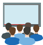
Elaun Latihan (EL)